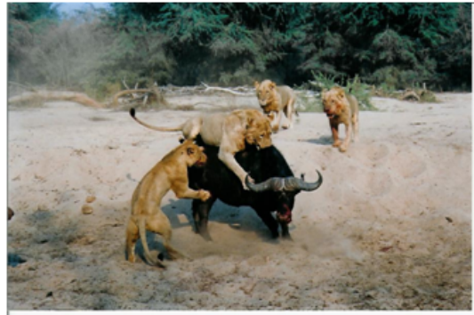
Lion pride catches water buffalo and gets a meal

Predation - an interaction in which one organism captures and feeds on another